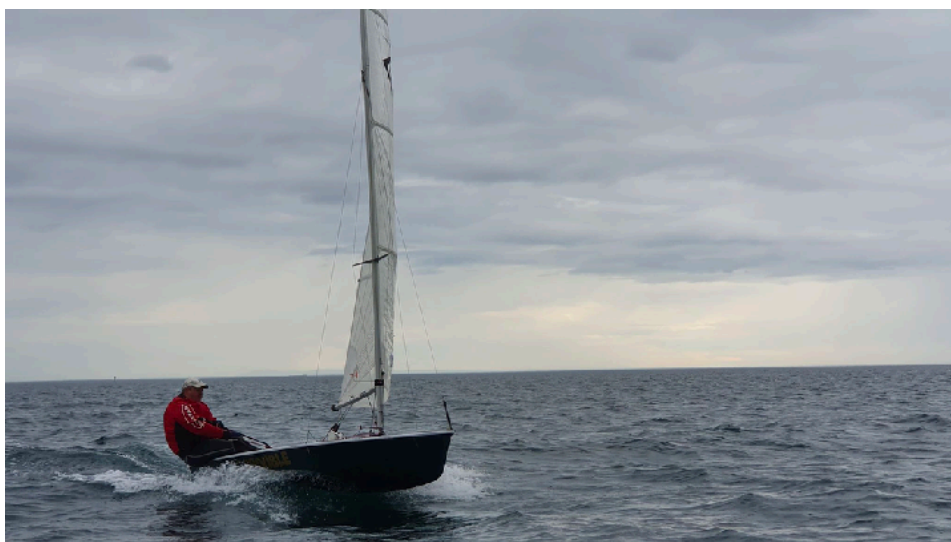
DOUBLE TROUBLE PLANES AWAY FROM THE FLEET

rumours of a 20 foot, Uffa Fox designed yacht coming to the club this season which promises to keep the trailerable fleet on their toes.