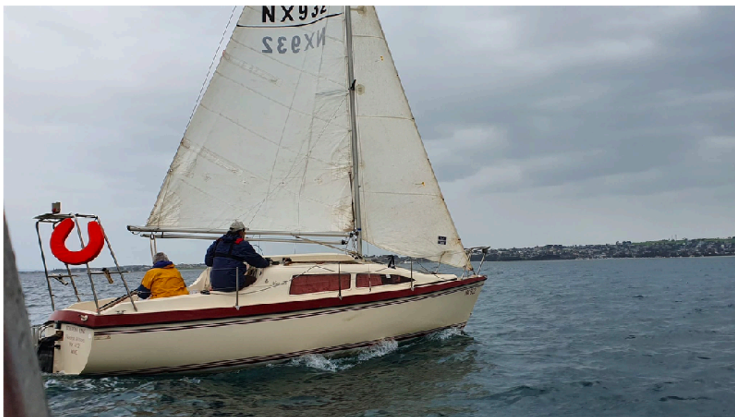
BOTTOM LINE BROAD REACHING

T h i s Sunday is the first long race of the season, always a favourite amongst t h e trailerable fleet. With E l e v e n