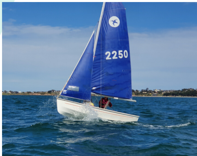
Name to Come punches upwind through steep chop

Eleven was able to just cross Which Way Up to take the lead by the top mark. The two leaders set fractional asymmetric spinnakers for the relatively tight reach to the wing mark, surfing down the steep chop.