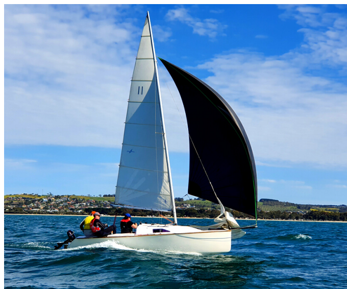
Eleven surfs down the first reach

The start line of the second race was set with minimal bias. Eleven , Which Way Up and Ms Agro jostled for position at the boat end, luckily all three boats getting off the line cleanly. Which Way Up tacked off towards the right hand side of the course early, with the rest of the fleet continuing off on starboard.