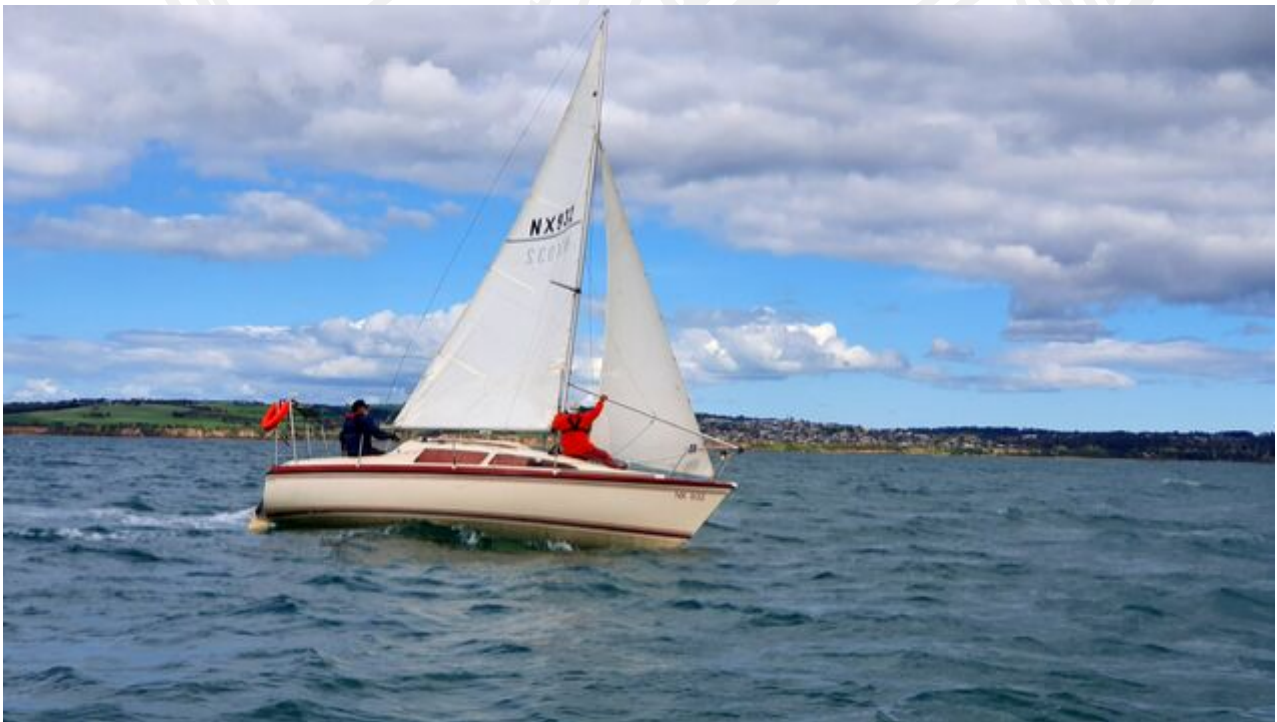
Bottom Line sets up for quick spinnaker run home